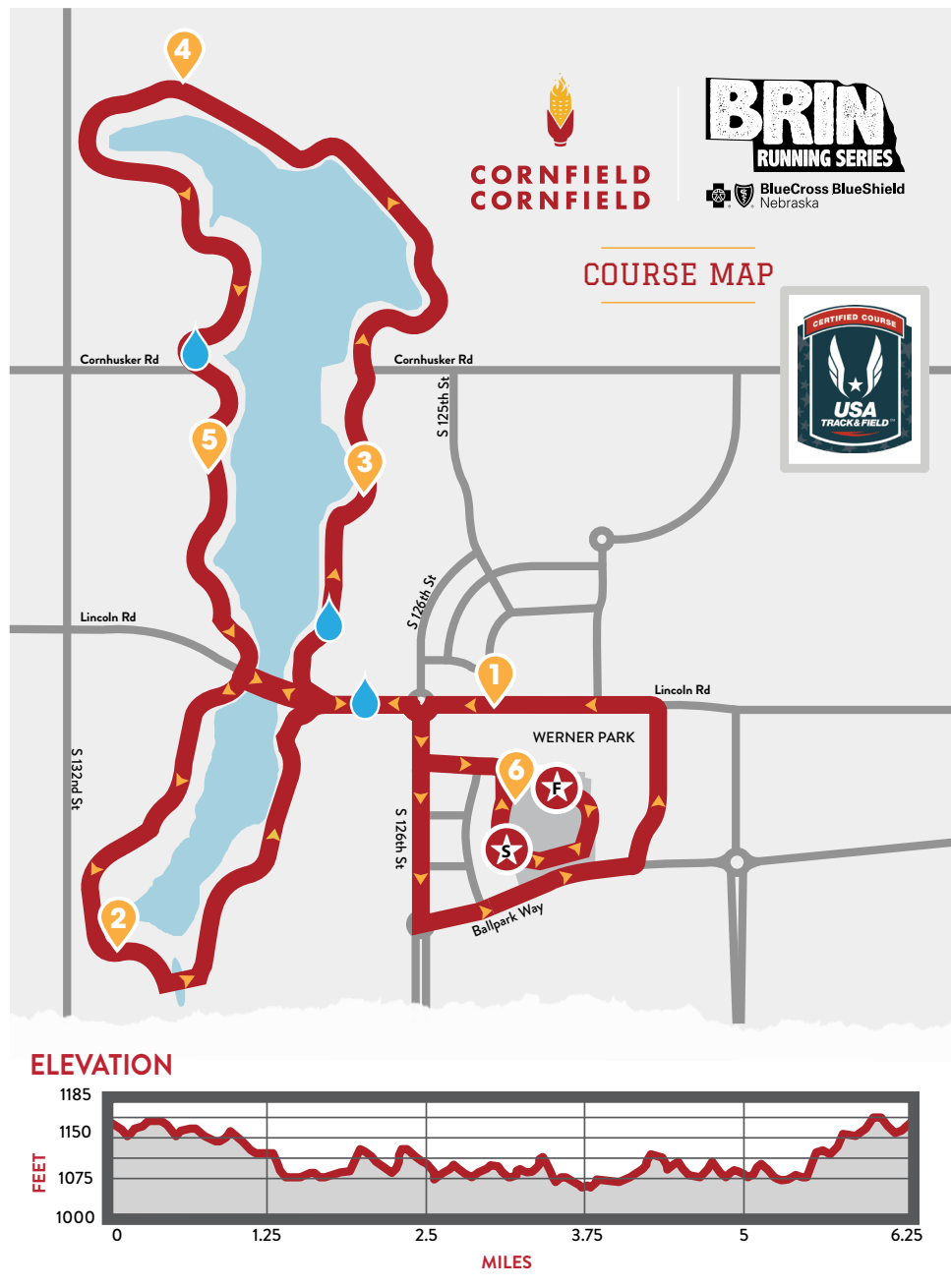
START / FINISH MAP WERNER PARK 12356 BALLPARK WAY PAPILLION NE 68046 PARKING PARKING PARKING PARKING PARKING PARKING PARKING START FINISH WERNER PARK STADIUM GATE 1 GATE 2 RESULTS ATHLETE RECOVERY PACKET PICKUP S 126TH ST BALLPARK WAY POWERED BY BlueCross BlueShield Nebraska BRIN RUNNING SERIES